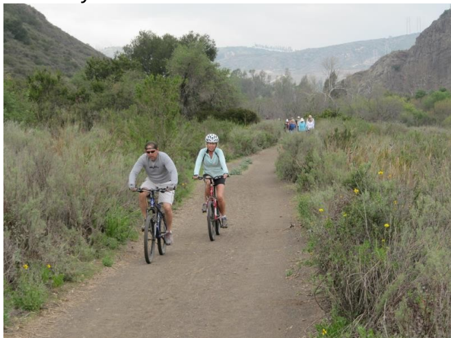
Hill Canyon Fire Road